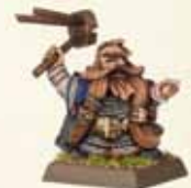
Nick used this dangerous barstool to represent The Blade of Prescient Perfection.