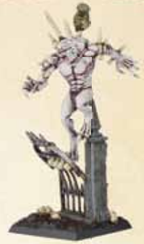
The corpse pinned to the back of this Crypt Horror is an ideal Totem of Bileous Curses .

Please note your leader cannot take the Regiment Standard Veterans Kit.