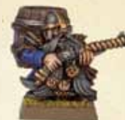
Nick used the barrel full of courage-including dwarfen beer to act as his Regimental Standard .

Your Leader may choose up to 20 points of Magic Items from the Warhammer Rulebook following all the normal rules. (Pages 173 – 177). These points do not come from your 100 point Regiment allocation and are “free” – your Leader needs to be special, after all! (If your Leader is only equipped with Claws/Teeth/Fangs or some other such “non-weapon” that for all intents and purposes counts as a hand weapon, then you may still buy him Magic Weapon from the list.)