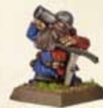
The dwarf quarreller could easily be carrying Hand Crafted Ammo .