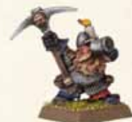
This dwarf miner is a great way to represent Kraggis Pack.