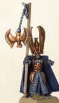
John used this model to represent the wielder of The Epic Flail.