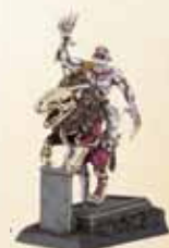
Zak mounted a ghoul to represent the extra movement gained by the Worn Boots of Unseemly Haste .